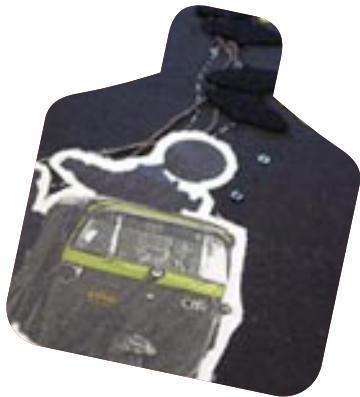
ARTI SANDHU Mixed media/enlarged necklaces

'Haar-shringar' Jewellery concepts for the 'modern' Indian woman, where animals, lamp posts, scooters, rickshaws and other images (all taken from Delhi's chaotic roads) hang off a tangled network of electricity cables all illustrated combining photography and textile craft techniques to form a collection of (un?)-wearable necklaces and brooches.