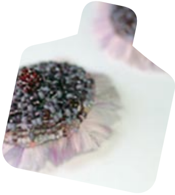
EMILY BULLOCK beats jewellery

Continuing my interest in isolating parts of the body, in the JOC exhibition, the breast, I will re-appraise the line between clothing, decoration, theatre, adornment and art.