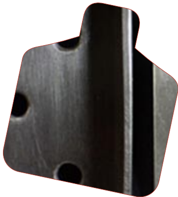
STELLA CHRYSOSTOMOU mixed media, jewellery

HOLE investigates the power and meaning jewellery exerts through its absence.