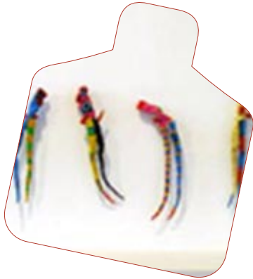
SHELLEY NORTON jewellery

I like to play with our culturally constructed stories of what jewellery should be, exploring along the way how we make meaning, and by using the discarded wrappings of the desired object, grow unbridled and unfettered thought.